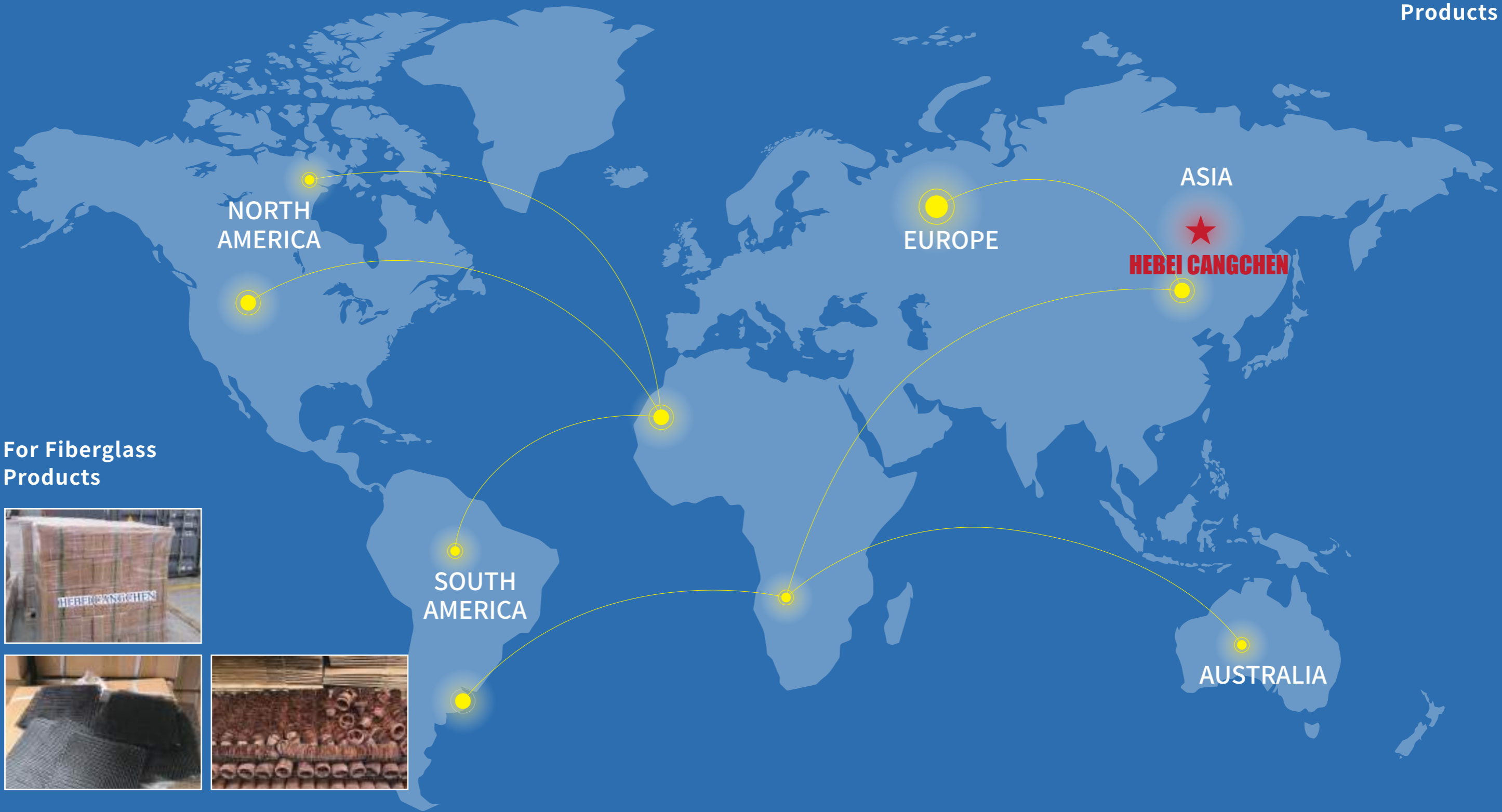
For Fiberglass Products