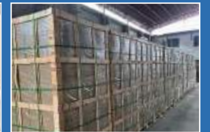
For Ceramic Products